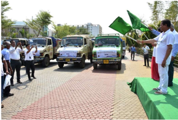
Flagging off of vehicles with relief materials

iv. Distribution of relief materials to Fani affected regions of the state of Odisha in collaboration with KISS.