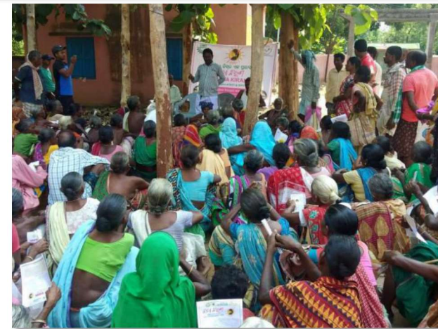
Kanya Kiran 3.0