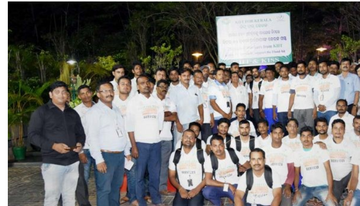
Team of skilled workers sent to Kerala

v. The University extended its medical and technical support by sending 25 member medical team and 75 skilled workers to Kerala on 22nd August, 2018 to render medical services to flood affected people.