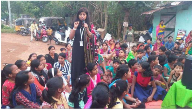
Awareness on cyber crimes