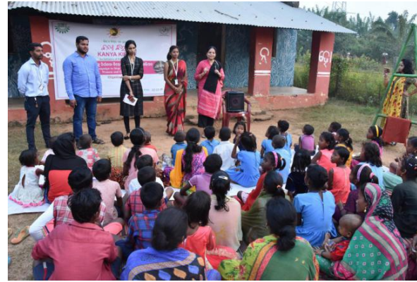
Good Touch , Bad Touch Awareness programme