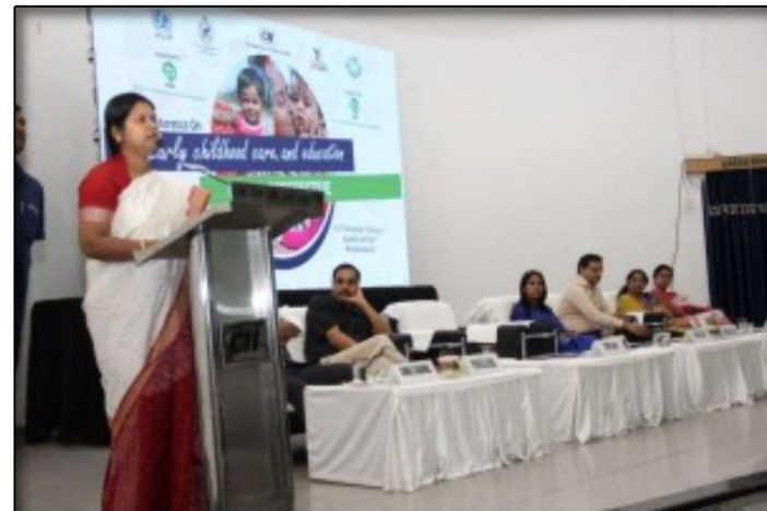
Seminar on Early Childhood Care and Education - Indian Perspective

Chapter. The discussions were held in two rounds. First round focused on need for providing early childhood care while the second round pondered over the ways to ensure quality access to these services.