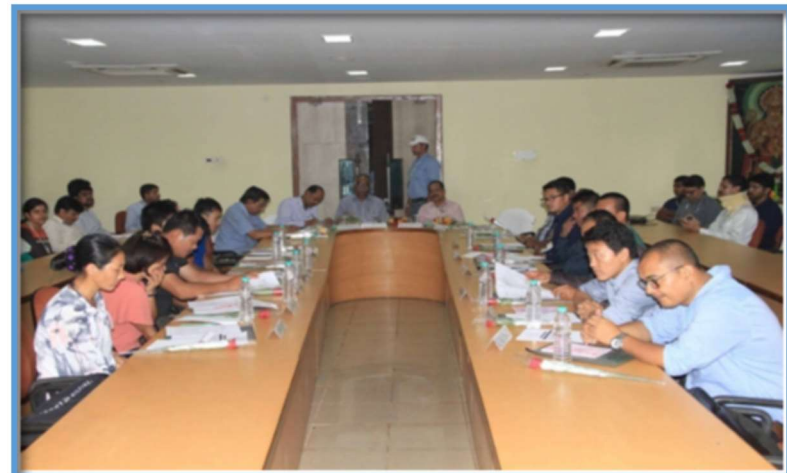
Various programmes under Bhutan MOU