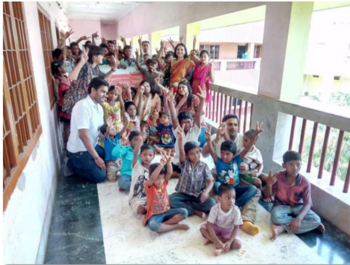
Art of Giving in a Orphanage

Sweden, Uganda, Bahrain, Ethiopia, Ireland, Kyrgyzstan, Mongolia, Nigeria, Pakistan, Russia, Saudi Arabia, Singapore, South Africa, South Korea, Syria, Turkey, among other countries.