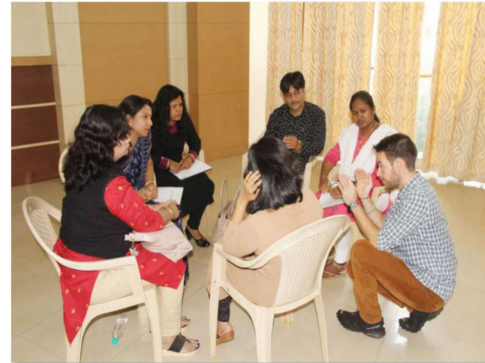
Workshops on Compassionate Integrity Training