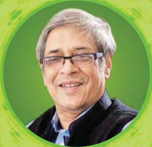
Padmashri Dr. Bibek Debroy