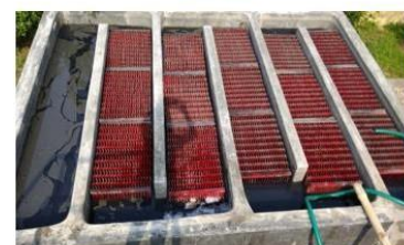
Prototype of 9m3/day processing capacity.