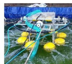
Sediment Aeration System