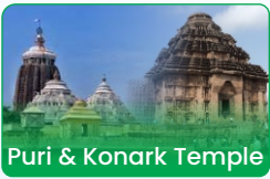
Puri & Konark Temple