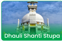
Dhuli Shanti Stupa