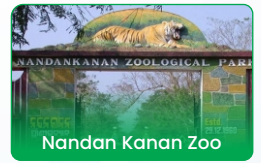
Nandan Kanan Zoo