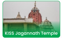
KISS Jagannath Temple