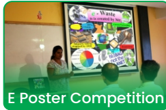
E Poster Competition