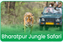
Bharatpur Jungle Safari